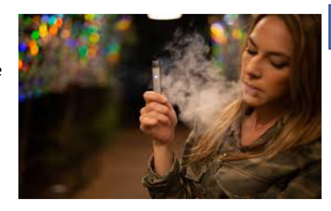
Adolescents knowledge about vaping

In September 2019 we surveyed 300 high school students from hazard high school in Kentucky from grade 9 to 12. The survey included questions about their knowledge of vaping before starting and why did they start vaping and also included their intention to quit and if they were able to quit. Data was collected and analyzed using SPSS Version 26.