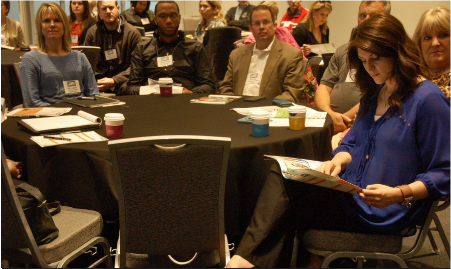
2016 KPHA Conference Opening Session